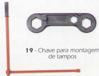
19 - Chave para montagem de tampos